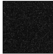
Sanded Onyx Minimum 1%