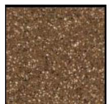
Pebble Copper Minimum 1%