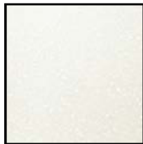
Pebble Frost Minimum 1%