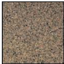
Quarry Mesa Minimum 1%