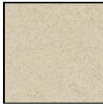
Sanded Gold Dust Minimum 1%