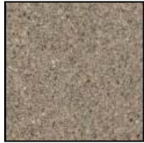
Aspen Brown Minimum 1%