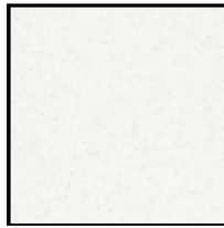
Sanded Cream Minimum 1%