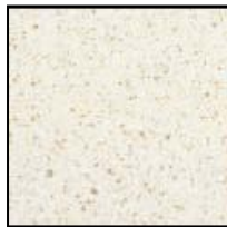
Quarry Oyster Minimum 1%