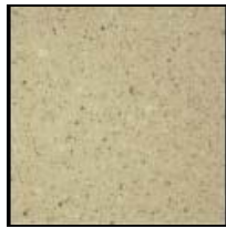
Pebble Seastar Minimum 1%