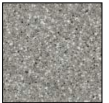
Pebble Grey Minimum 1%