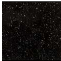
Pebble Ebony Minimum 1%