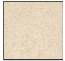
Sanded Sahara Minimum 1%