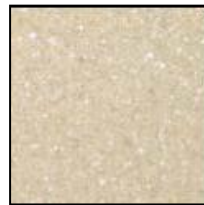
Pebble Gold Minimum 1%