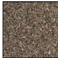
Quarry Bluff Minimum 1%

This Technical Bulletin is intended to provide guidelines for optimal fabrication, installation, and performance of LOTTE ADVANCED MATERIALS products mentioned. Though the information contained herein is deemed reliable, none of the contents--including but not limited to the instructions, techniques, graphics, and recommendations--is to be understood as implying legal liability of fitness for a specific purpose, any other type of warranty, or being complete or absolute in its range and nature of information.