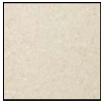
Pebble Saratoga Minimum 1%