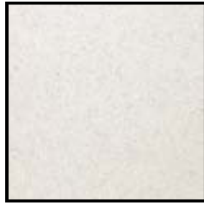
Aspen Snow Minimum 1%