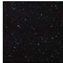
Pebble Sienna Minimum 1%